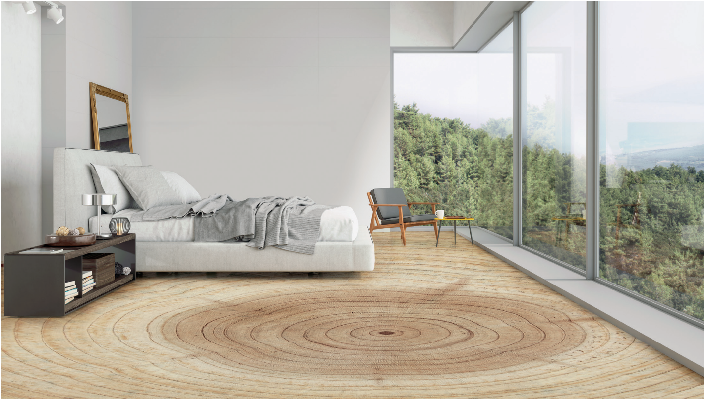
The look and feel of natural wood

Traffic Raw HD gives you an ultra matt natural floor, no matter which way you look at it.